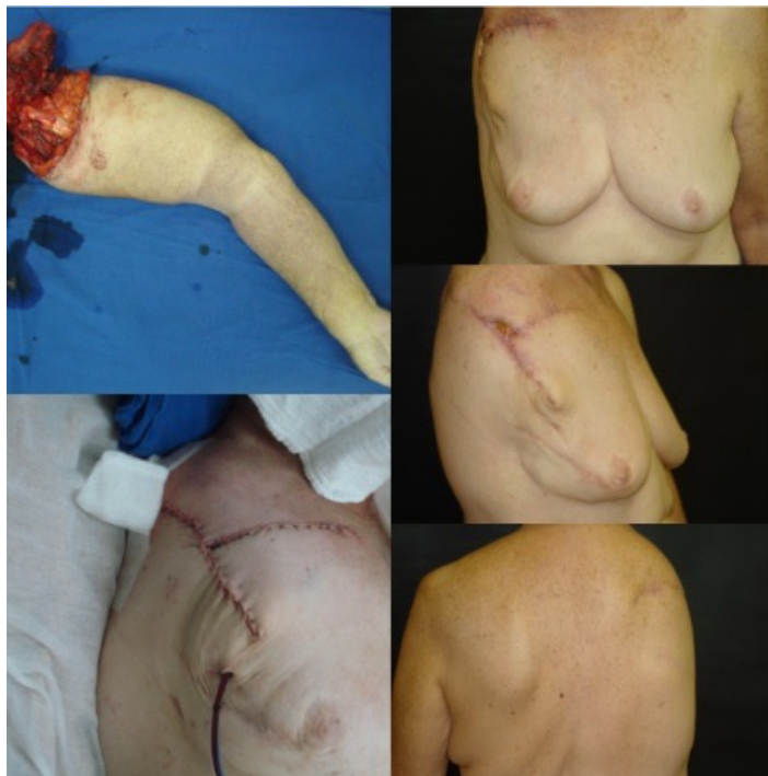
Figure 4. A. Immediate postoperative period after Berger surgery, with drain; B. Surgical specimen removed in the Berger procedure; C-E. Late postoperative images of the Berger surgery, showing the healing and evolution of the procedure.