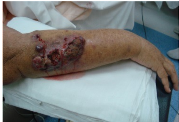
Figure 1. Cutaneous lesion showing erythematous plaque with coalescing, purple, bullous, and easily bleeding lesions on the right forearm, surrounded by satellite blood blisters, showing diffuse edema.

Berger's surgery (Figure 3) was the viable therapeutic choice for the Stewart-Treves angiosarcoma described in this report. Preoperatively, in addition to laboratory tests, computed tomography (CT) was requested, which revealed alterations in the coronal section of the right part of the upper limb, showing subcutaneous lymphedema throughout the limb. The surgery was successfully performed and without complications, in the postoperative period, maintenance dressings were applied to the surgical wound, progressing satisfactorily (Figure 4), and the patient was discharged 25 days after the therapeutic approach. The surgical specimen was sent to the anatomopathologist showing margins of surgical resection of the specimen, skin and dorsal muscle fragments free of neoplasia, proximal stump showing vascular and neural structures free of involvement