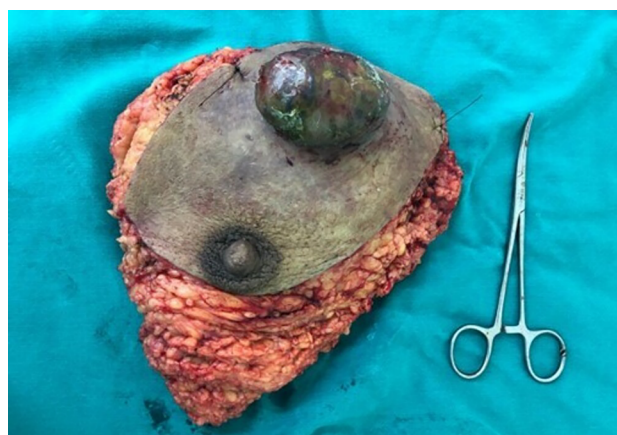
Figure 2. Surgically removed left breast showing a tumor simulating an abscess.