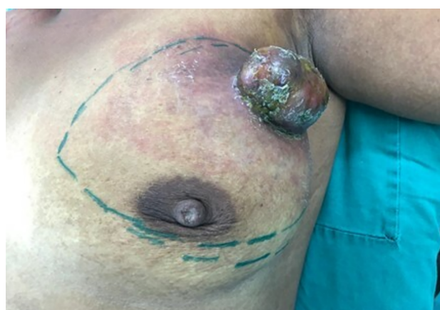
Figure 1. Abscess-like breast cancer before surgery.

The patient had fever for 30 days since the admission and she was then accompanied by an infectologist. Therefore, she was unable to receive chemotherapy. Due to the accelerated growth of the tumor (Figure 1), a radical mastectomy and left axillary lymphadenectomy were then performed (Figures 2 and 3). She was discharged six days after the procedure in good general condition, discolored +/4+, jaundiced 2+/4+, breast with surgical wound in good aspect, without secretions or phlogistic signs.