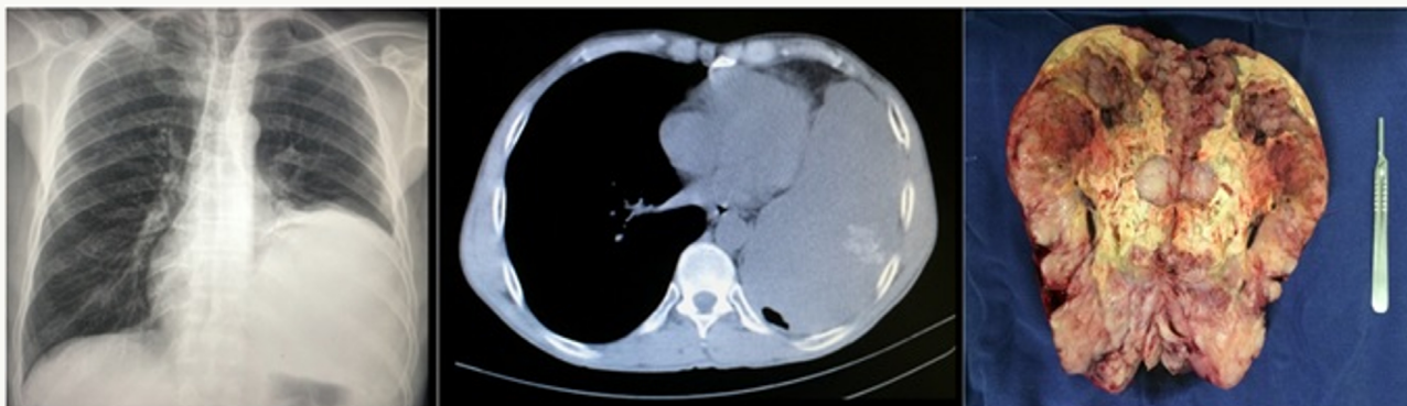
Figure 1. Left: chest X-ray presenting a bulky opacity at the left hemithorax base. Center: chest tomography presenting a bulky mass in the left hemithorax, of regular shape, with low density, and some calcifications inside it. Right: surgical specimen.

After 10 months of postoperative monitoring, the patient was clinically well and did not present any other hypoglycemia episode. Imaging follow-up did not present signs of recurrence or metastases until now.