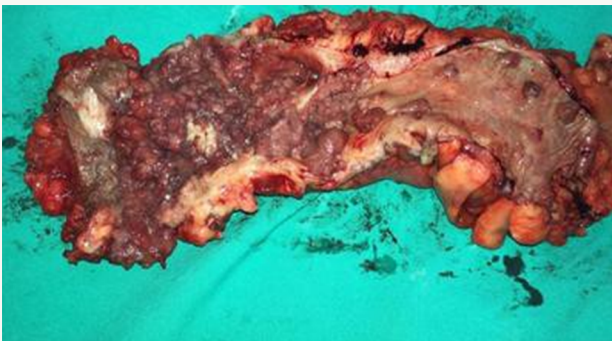
Figure 3. Abdominoperineal rectal amputation with polypoid lesions, occupying the entire rectum, with intense friability.

disease was evaluated. The colonoscopy did not show other inflammatory areas in the colon or terminal ileum. There was then a progressive worsening of the anorectal disease, with the appearance of new fistulas and the development of pyoderma gangrenosum. He received a corticosteroid pulse and the biological therapy with infliximab was initiated (2008). There was a control of anorectal manifestations with superficial abscess drainage, setons placement, and maintenance of biological and immunosuppressive therapy for about 4 years, and the setons were progressively removed during this period. The colonoscopy at the time showed mild to moderate proctitis. After 3 years, the patient returned with the onset of intense tenesmus, mucorrhea, and rectal bleeding. A colonoscopy was performed, showing an extensive polypoid lesion, occupying the entire rectum, with intense friability. The biopsies showed high-grade adenomas with foci of adenocarcinoma. Based on clinical evolution and histopathological diagnosis, abdominoperineal rectal amputation by video laparoscopy was performed and the pathology of the surgical specimen was demonstrated (Figure 3).