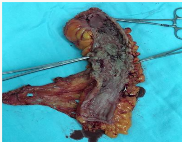
Figure 1. Rectosigmoid colon with morphological findings suggestive of large cell non-Hodgkin's lymphoma.

malignancy. Based on the long-term evolution of the disease, clinical and endoscopic findings, the patient underwent surgical treatment involving abdominal rectosigmoidectomy by videolaparoscopy with primary colorectal anastomosis. The cavity inventory showed only the rectosigmoidal thickened area. Histopathological examination showed morphological findings suggestive of large cell non-Hodgkin's lymphoma (Figures 1 and 2).