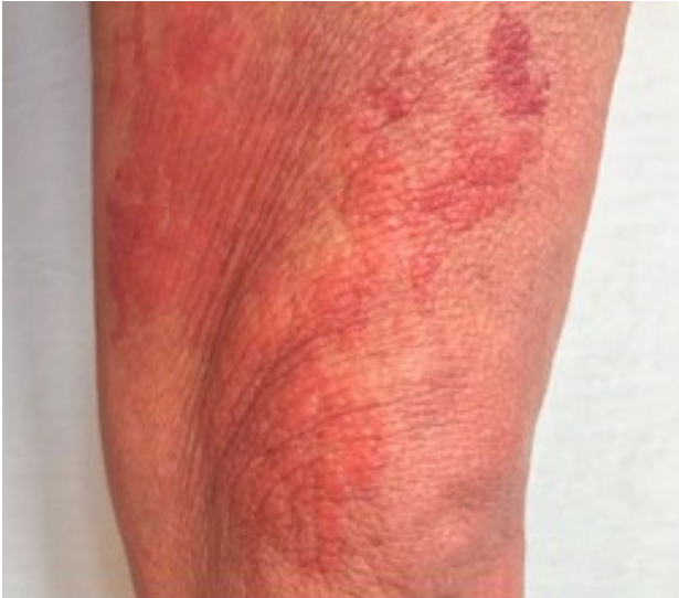
Figure 1. Asymmetrical vesiculobullous lesions.