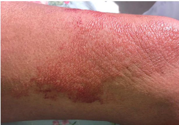
Figure 2. Asymmetrical vesiculobullous lesions.