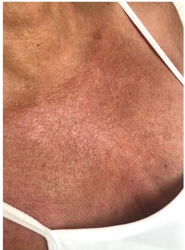
Figure 5. Polkyoderma (thorax). Shawl sign.