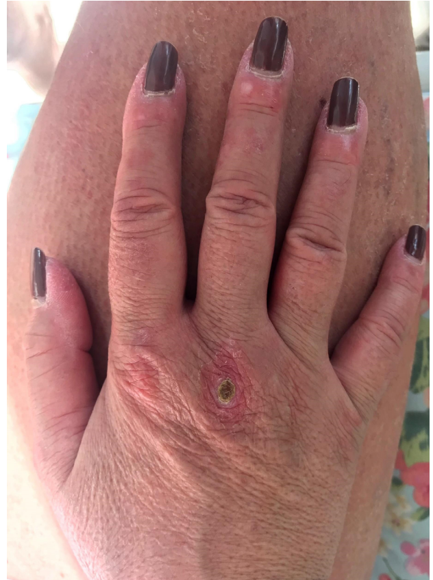
Figure 4. Gottron's sign and erythematous papule on the knuckles and interphalangeal joints of dorsal fingers.

The presence of the hallmark cutaneous manifestations of DM, besides proximal muscle weakness (an objective evidence of muscle inflammation characteristic of DM) and the elevation in the level of AST and ALT (indicators of muscle disease activity in DM) established the diagnosis (4,5) . The histopathology of vesiculobullous DM is not specific; usually a subepidermal blister is seen along with dermal edema and mucin deposition; other bullous diseases such as lupus erythematosus, bullous pemphigoid, dermatitis herpetiformis were ruled out by histopathological features.