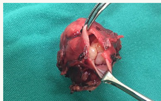
Figure 3. Intraluminal tumour and negative margin.